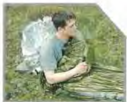
Small Survival Blanket