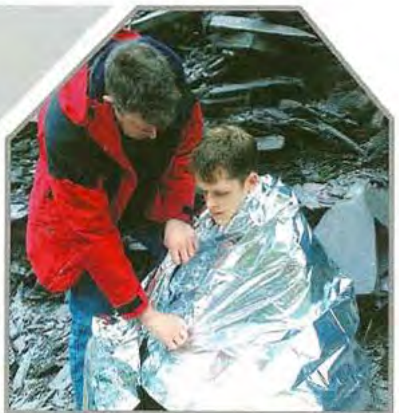
Blizzard Foil Blanket