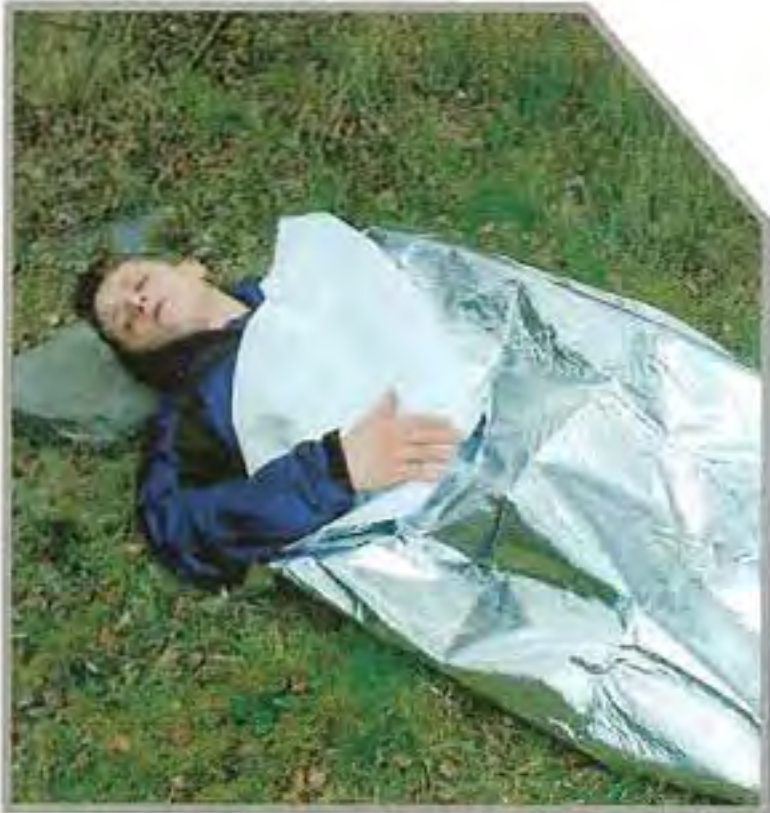
Blizzard Absorbent Blanket

A lightweight blanket designed for medical use. One side reflects heat, the other is absorbent for comfort. Warmer, more robust and easier to handle than single layer reflective blankets.