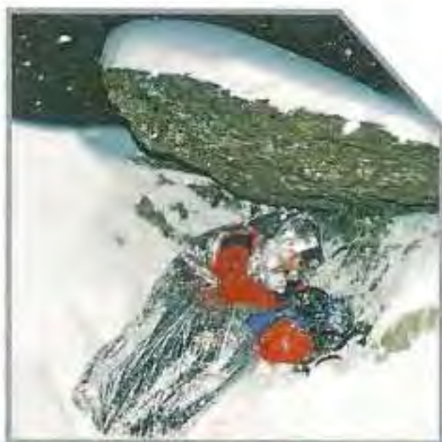
Survival Jacket (full-length)

includes sleeves, sealable hood, and smaller packed size.