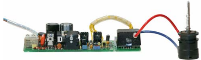
Labino® Trigger Ballast