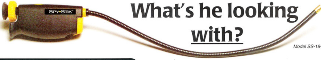
Model SS-1840L Shown